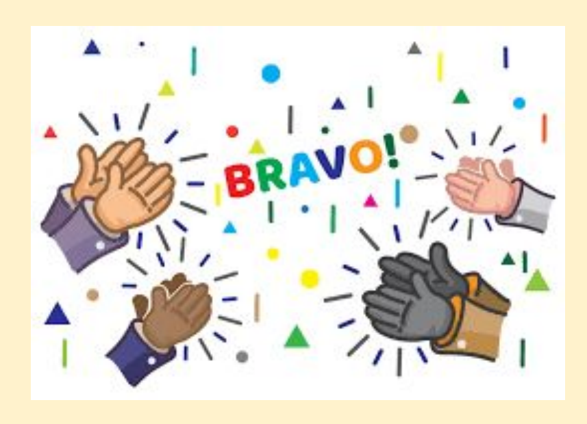
Have a good week everyone!